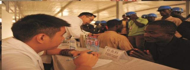
加纳华侨华人庆祝国庆70周年系列活动之慈善义诊（光明国际自由贸易区义诊区） Free Medical Outreach Service in Celebration of 70th Anniversary of the Founding of PRC by Chinese People in Ghana (session at Bright International Free Zone)